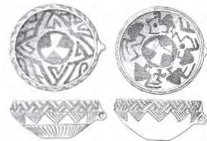
Figure 7. Swastika symbols in the Armenian cultural artifacts.