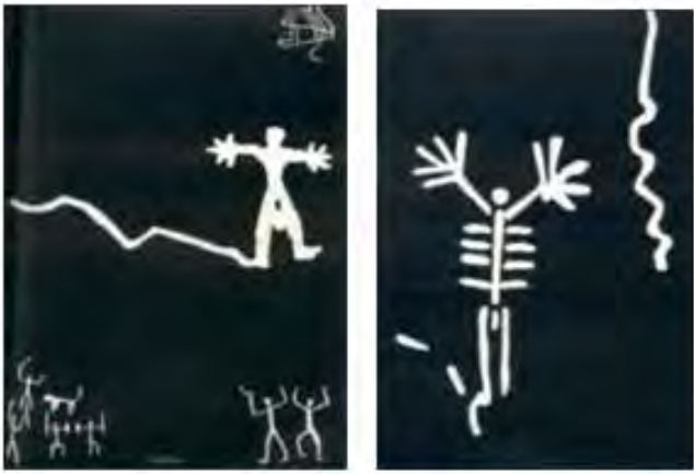
Figure 18. Rock Art: man and serpent, Armenia

(the forefather of the Sauromats), Torgom/Togarmah (the forefather of the Caucasians, particularly, his son Hayk – is the patriarch of the Armenians) and Javan (the forefather of the Greek people). The Armenian historian H. Draskhanakertsi (10th century) mentions, that Tiras and Javan moved to Europe, the Balkans, Tiras ruled Phrygia , Javan – Greece, and his son Elishah is the ancestor of the Sicilians and the Athenians [4]. Askanaz moved to the coast of the Black Sea (further towards the Sea of Azov), the Aesir settled in the Tanais river delta ( Vanakvisl , present-day Don ) 17 . According to ancient historians, this river separated Asia from Europe.