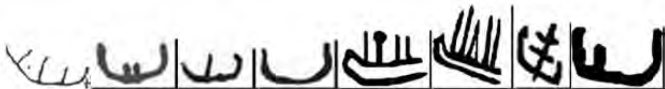
Figure 15. Petroglyphs: ships and boats, Ughtasar, Armenia