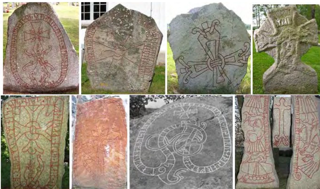
Figure 5. Scandinavian runic stones depicting cross, Sweden

and *nav (Armenian ship ). According to Norse mythology, Aesir Odin came to Scandinavia with the sage Vanir Njord , who settled in Noatun. The shipyard Noatun goes back to old Armenian semantic compounds *nav (Armenian ship ) and *tun (Armenian home/house ), and is translated literally as the ship house .