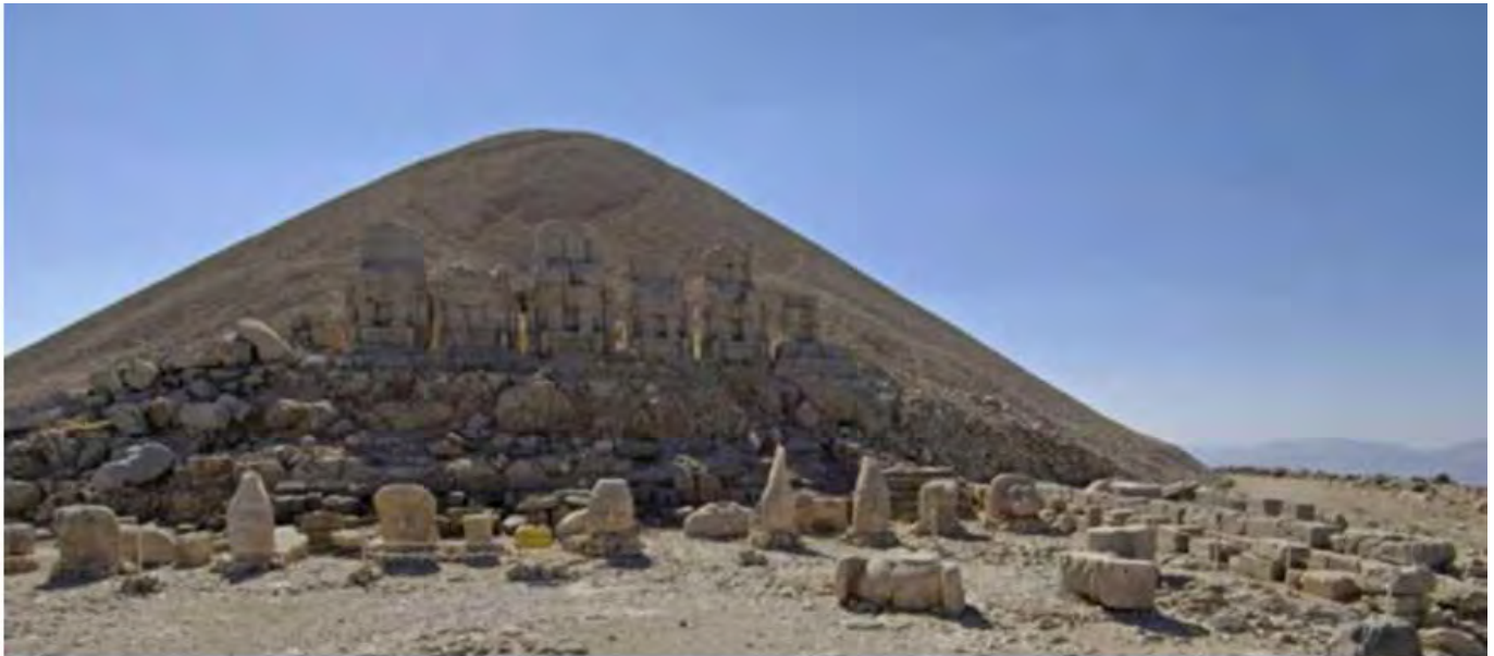
Figure 16. Tumulus on Mount Nemrut Figure 17. Rock Art: ploughs, carts, Armenia