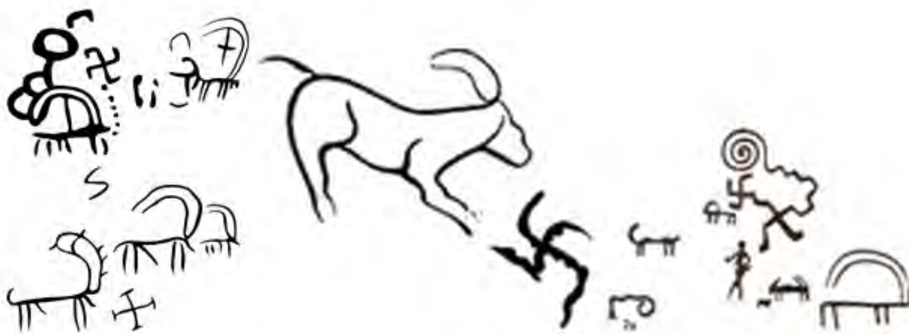
Figure 6. Depictions of crosses and swastikas in the Armenian rock art

Of particular interest is the etymology of the musical instrument Lur , discovered at Nordic excavation and depicted in rock art. This cultic and ceremonial instrument was used either for ritual purposes or to attract attention, report news, etc. In Armenian language the morpheme *lur' means news, rumor (compare with Armenian *lur – silent, noiseless ).