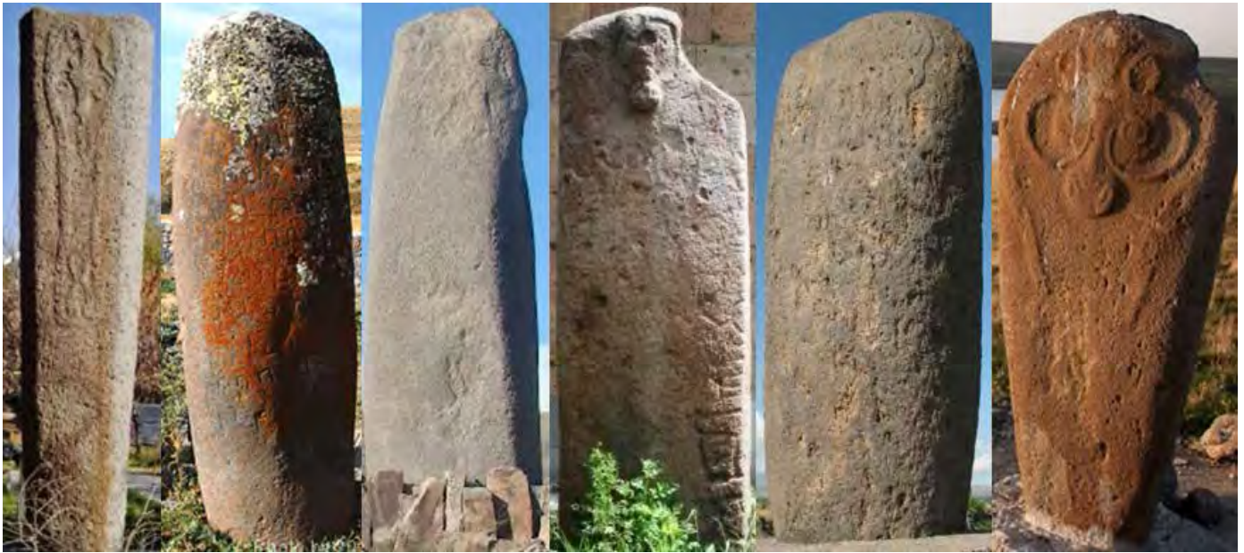
Figure 2. Armenian vishapakars (dragon-stones – basalt steles depicting dragon)

of different peoples. Contrasting, analyzing, assessing and evaluating linguistic, mythological, historical and visual patterns of culture in the frameworks of invariant multi-dimensional knowledge systems, makes it possible to reconstruct a unified worldview adequate to the reality, which was perceived and reflected in the collective or social consciousness of particular people in time and space.