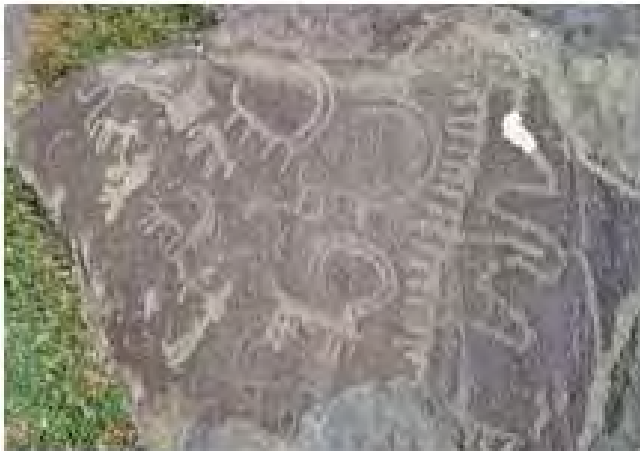
Figure 14. Rocks and figures depicting ships, Ughtasar (Armenia).

According to the Swedish National Encyclopedia, tumulus is an absolute synonym of the word kurgan (Swedish - gravhög ) 11 . The etymology of this toponym goes back to old Armenian language: with the semantic components *grav (Armenian sign, affirmation ) and *hogh (Armenian land ). The name of the toponym Tanum 12 (Norse Túnheimr ) goes back to the components *tun (Armenian home, land , comparable with Armenian *tanel - lead, take ) and *hem (Armenian now, current ), forming the semantic core “ current home ”.