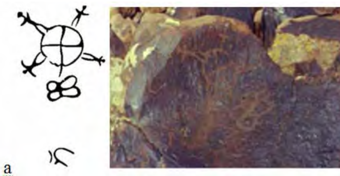
Figure 9. Armenian rock art: the World Tree