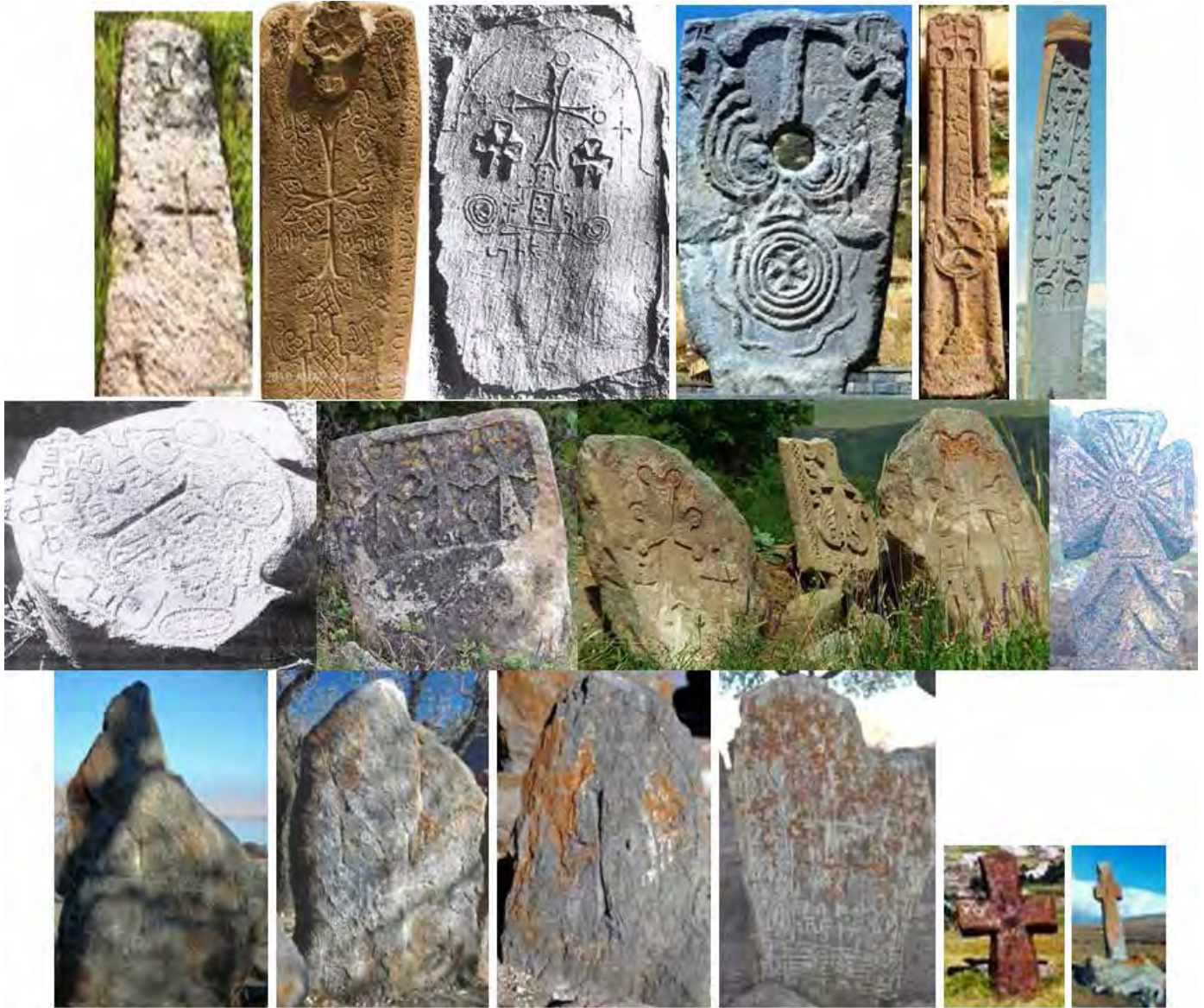
Figure 4. Armenian khachqars (cross-stones, stone steles depicting cross)

Scandinavia, Noatun, Sveygdir , etc. The earliest identified source for the word form Scandinavia is Pliny the Elder's "Natural History" [2]. Researchers consider that the goddess and the giantess Skadi might have once been a personification of Scandinavia, which goes back to proto-Germanic skadinaujo - "the Island of (goddess) Skadi" 1 .