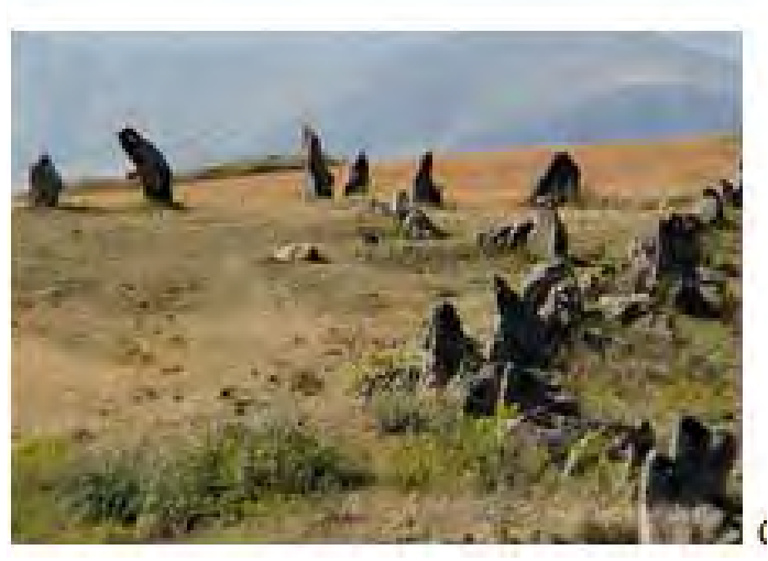
Figure 29. Stone observatories: Armenia

The history of the Aesir and the Vanir [1, 3] and their resettlement from Asia to Sweden includes the description of Odin's (the chief god of Norse mythology) visit to Scandinavia. The proper noun Óðinn or Wōdan/Wōtan stem from Wōdanaz or Wōðinaz , which go back to Proto-Germanic Wōdaz ( seer, prophet ). In fact the name Wōdan or Wōdanaz/Wōðinaz include Armenian components *vo (va/wa/ua - Van) , *đā/đī (*dits - divine) and *az/as (from Askanaz - name of the founder of first Armenian home (Armenian *tun/tan - home ). Considering the two compounds "wo/wa" and "tan/tun", the name Wōdan/Wōtan may as well be interpreted as the home/house (Armenian tun) of water (living, sacred, life-giving water), which conceptually identifies its affiliation with the people in the kingdom of Van - the house of the Vanir, or initially the house of Askanaz, considering the fact that before moving to Sarmatia, Askanaz founded the house (Askanazi tun), which he passed over to his younger brother Torgom . It was later renamed to the tun of Torgom (the house of the people in the kingdom of Van, located near the