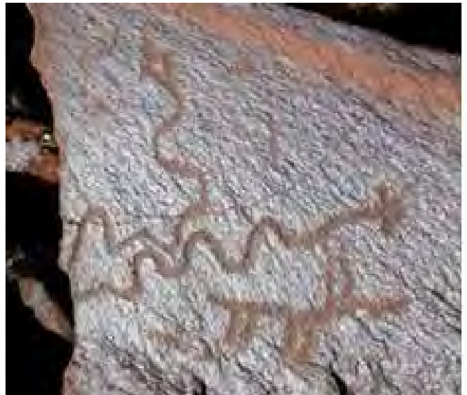
Figure 19. Rock art: serpent swallowing the sun (conceptual model of the results of the volcanic eruptions and lava flow), Armenia