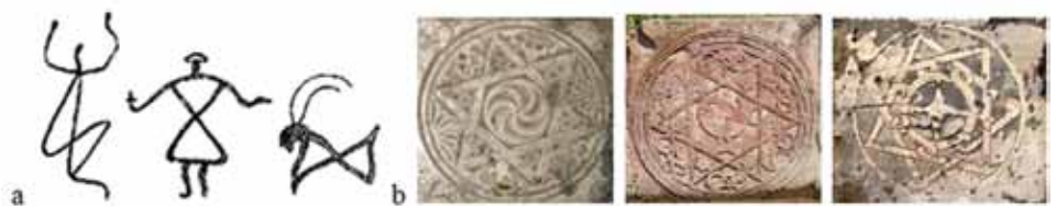
Fig.1 - Mountain as model of home (a); glkhatun (b); ideographic depiction of home-mountain, Armenia (c) Fig.2 - Graphic depiction of triangles in the Armenian rock art (a). Relief depictions of two triangles, Armenia (b)

Keywords: Concept “home”, cultural-linguistic picture of the world, archaic consciousness