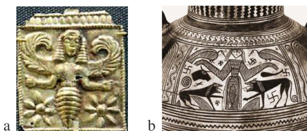
Fig. 5. (a) The forces of nature embodied in the image of mother, progenitress, tutelary of fertility and harvest, the master of flora and fauna, household, underworld, tutelary of cities and settlements. (b) Vase depicting the Great Mother with six swastikas. The entire composition is enclosed with vertically twisted snakes (symbols of the underworld) from both sides

The great mother goddess on Crete was depicted as a queen-bee (Latin Api-apium , meaning bee ), the preserver of the whole swarm of bees, or metaphorically, the human race (Fig. 5a). The vase, discovered in the Knossos palace of King Minos, depicts the great mother goddess (Fig. 5b) with her arms traditionally raised and ornamented with six swastikas. She is holding two celestial birds. Two roaring lions are depicted from both sides of the great mother. Beneath the right hand of the goddess is the head of a sacrificial bull , the frontal part depicts fish . Such depiction of a fish was considered a symbol of the great mother in Harappa (North India). From left and right sights the entire composition is enclosed with vertically twisted snakes, symbolizing the underworld, embodying the “celestial vishaps/dragons” that emerge during volcanic eruptions and threaten the sun and the moon in the sky, causing solar and lunar eclipse (Fig. 5b).