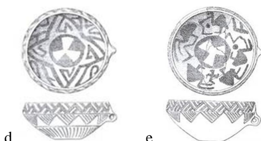
Fig. 2. Depictions on ceramic pottery, Old Armenia (2 millennium BC). The triad-force (the three bogatyr, the sons of the Mother Goddess, the goddess of thee earth) symbols are depicted centrally

The ancient Armenian ceramic pottery depicts: (d) volcanic mountain chain with four peaks, snakes-volcanoes – the stylized images of the forces of nature – the three heroes. (e), fighting against the forces of nature, the forces of evil and death - the snakes, huge celestial birds with huge beaks. Swastika – the symbol of Vahagn, born in the result of interaction of the four fundamental forces of nature.