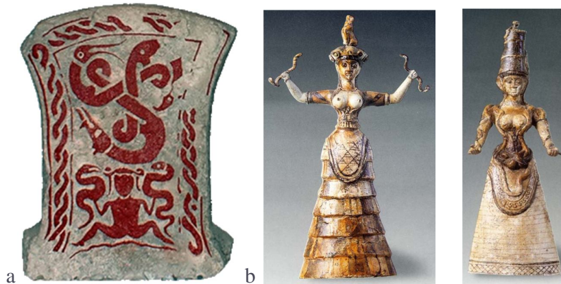
Fig. 1. (a) Memorial stone from the Swedish island Gotland (400-600 AC) depicting Frigg holding snakes. (b) Goddess holding snakes, Crete (c. 1600 BCE)

According to conventional opinion, the well-known memorial stone (Fig. 1a) from the Swedish island Gotland (400-600 AC) depicts goddess Frigg holding snakes. The unique statuettes of a goddess holding snakes are discovered on Crete (Fig. 1b), which date to c. 1600 BC 1 . The depiction of Frigg embodies a godmother with her legs wide open to give birth. In Norse mythology Frigg , Frige (Old Norse Frigg ), Frea or Frija (Frija – “ beloved ”) is the wife of Odin . She is the mother of the three gods Baldr , Hodr and Hermodr .