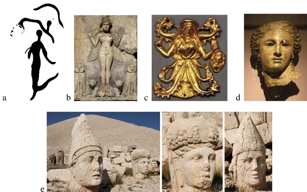
Fig. 4. (a) Petroglyph, a snake-legged goddess (Armenia). (b) 12 Astghik/Anahit/Inanna. (c) The Great Mother, the Scythian snake-legged goddess, Api (kurgan in Kul-Oba, Kerch) 13 . (d) Heads of Armenian goddesses in Commagene 14

Fig. 4 depicts female figures: snake-legged goddess descending from the mountain (rock art, Armenia); relief of Astghik/Inanna, Ishtar/Astarte (abducted from Aratta); snake-legged goddess of the Scythians and the bust of the Armenian goddess Anahit (possessed by the British Museum). Facial features and shapes of the goddesses and the mother goddess from Crete are similar (Fig. 1b.), which gives grounds to conclude: Astghik is the archetype of the Indo-European mother goddess, Venus, Aphrodite, Ishtar and Astarte. Her mother goddess Anahit is the prototype of pre-mother of all the gods: Astghik and Inanna ( Maruts and Tsovinar (cf. Vinar and Venus) in Armenian mythology), and Europa .