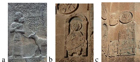
Fig. 3. (a) Relief depicting the Mother Goddess with the child and a cow (Hittite Empire), (b, c) Virgin Mary enthroned with Jesus (Cathedral of the Holy Cross, Van, Vaspurakan, historical Armenia, modern territory of Turkey)

Marija Gimbutas 10 , who has reconstructed the cult of the Great Goddess in Ancient Europe based on archaeological research, notes: “ taking into consideration the myriad of images inherited from prehistoric Eurasia, the source of ancient religious experiences was the great mystery of woman's life-giving power of creation. The great mother goddess, whose sacred darkness of the womb originated all creations, was the metaphor of Nature itself, the universal source of life and death, constantly updated in the continuous change of life, death and resurrection ”.