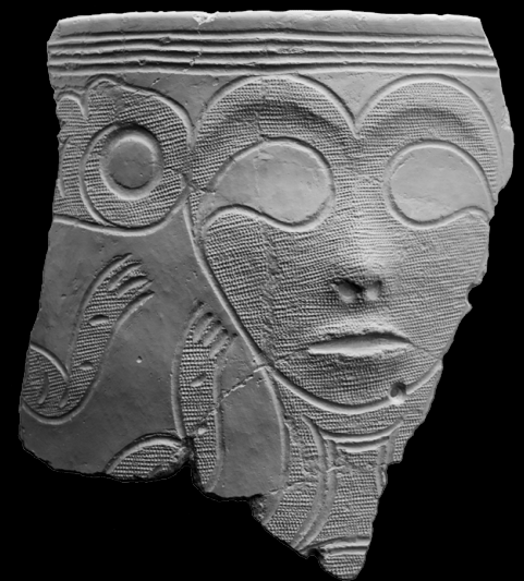
Ceramics of Voznesenovskaya culture, Russia

For order and information: atelier.etno@gmail.com